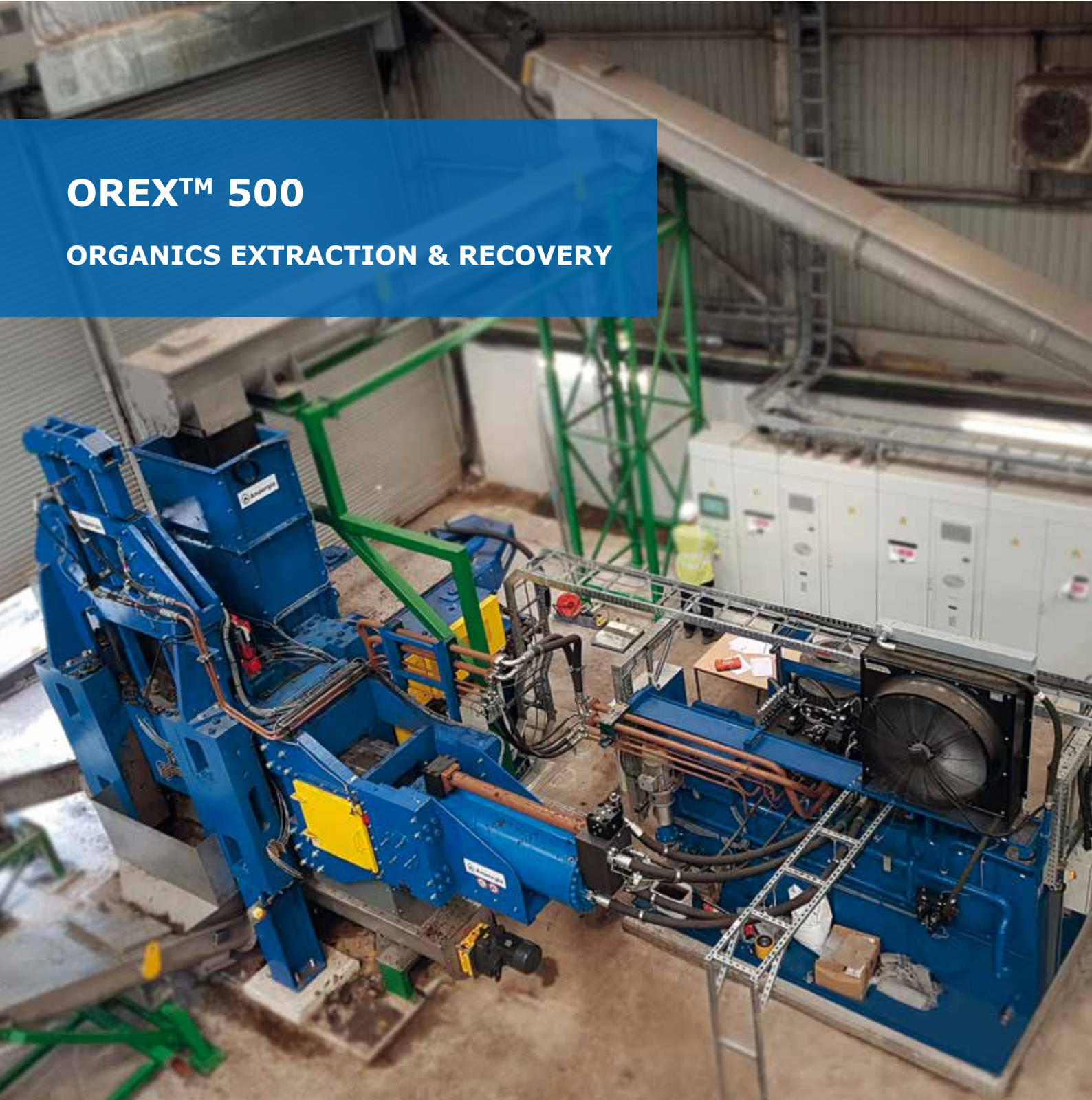
The OREX™ 500 Organic Extrusion Press